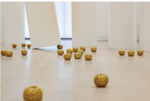
Füsun Onur Opus II - Fantasia (detay) 2001 [2021] Örgü şişleri, altın yaldızlı ip yumakları, porselen figürler, kaideler Arter Koleksiyonu